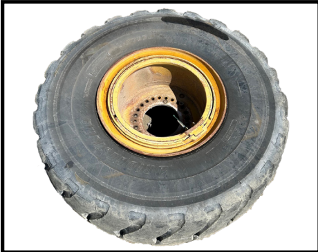
24H/M TYRES AND RIMS