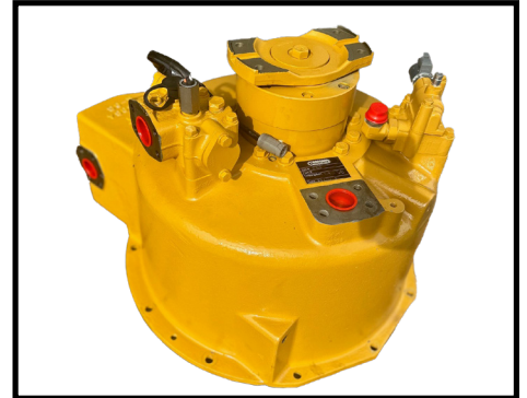
24H TORQUE CONVERTER

RECON EXCHANGE: $16,500+gst ea + failed iron. USED: $17,000+gst ea.