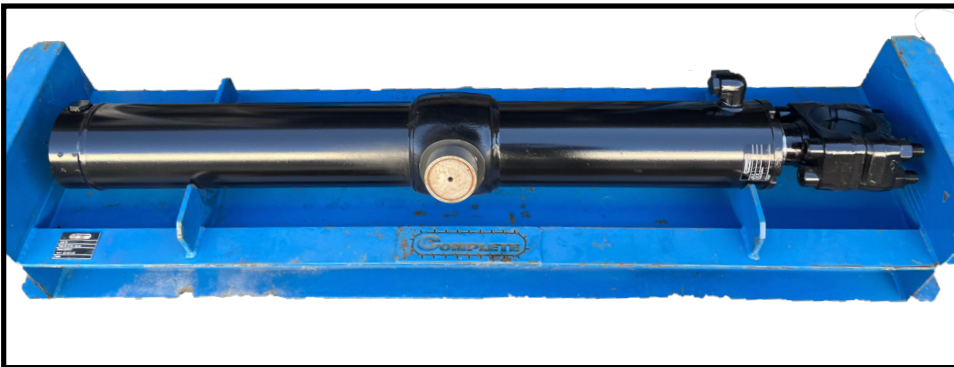
24H/M BLADE LIFT/ CENTRESHIFT CYLINDER

RECON EXCHANGE: $18,000+gst ea + failed iron. USED: $15,000+gst ea.