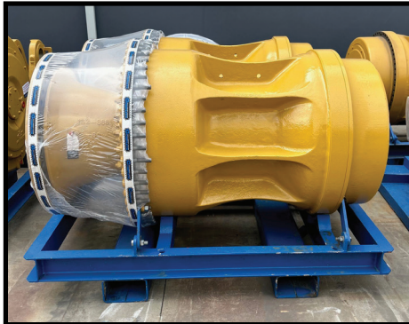
789D FINAL DRIVE

RECON EXCHANGE: $20,000+gst ea + failed iron. USED: $16,500+gst ea.