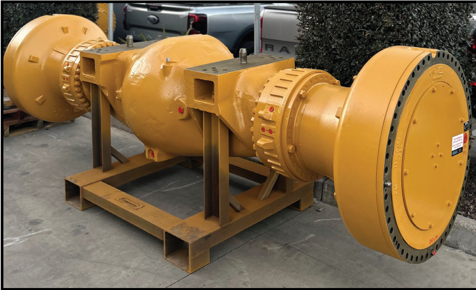
992G AND K FRONT AXLE GPS

RECON EXCHANGE: $99,500+gst ea + failed iron.