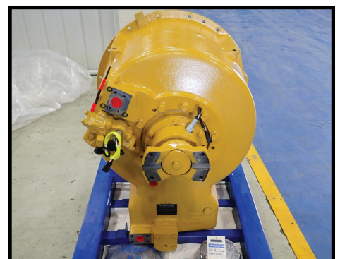
D11R/T TORQUE CONVERTER

T/C USED: $10,000+gst ea. TRANS USED: $25,000+gst ea.