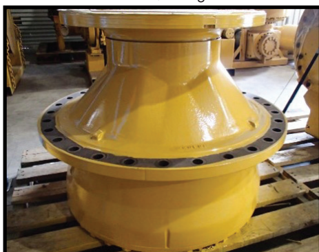
D11 R/T FINAL DRIVE

RECON EXCHANGE: $35,000+gst each + failed iron. USED: $30,000+gst each