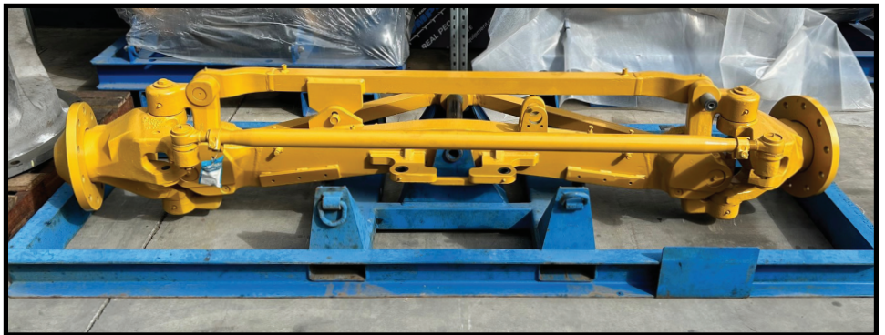
16M FRONT AXLE (BARE)

RECON EXCHANGE: $18,000+gst ea + failed iron. (NIL CORE FEE) USED: $8,000+gst ea.