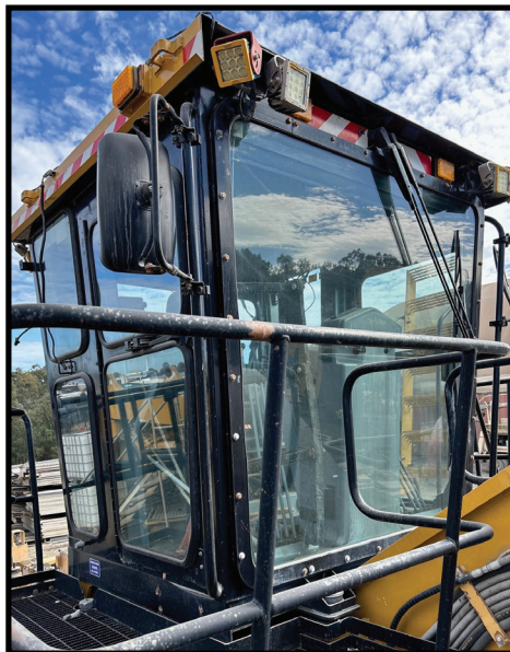
24H COMPLETE CAB