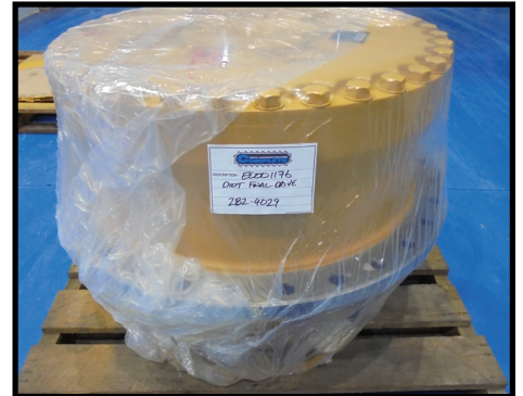
D10 R/T FINAL DRIVE

RECON EXCHANGE: $110,000+gst ea + failed iron.