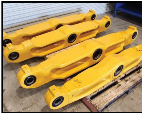
D10 R/T & D11 R/T EQ BARS

RECON EXCHANGE: $26,000+gst ea + failed iron. USED: $28,000+gst ea.